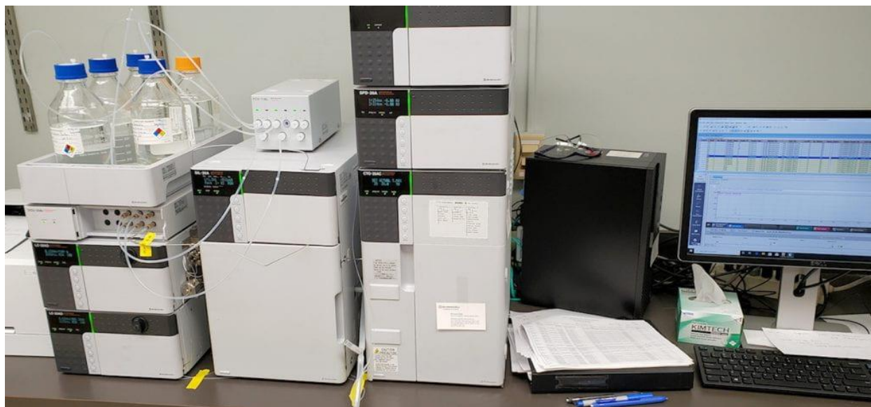
Fig. 3 HPLC setup with all accessories [10]

Understanding these technical aspects empowers researchers to harness the full potential of HPLC in diverse analytical scenarios, from pharmaceutical analysis to environmental monitoring and beyond. By mastering the intricacies of HPLC methodology and instrumentation, scientists can unlock new insights into complex sample matrices, driving advancements in fields ranging from drug discovery and development to food safety and environmental protection. By exploiting the unique vibrational fingerprints of molecules, FTIR spectroscopy offers a powerful tool for qualitative and quantitative analysis across a wide range of applications, from chemical identification and structure elucidation to process monitoring and quality control as shown in Figure 3.